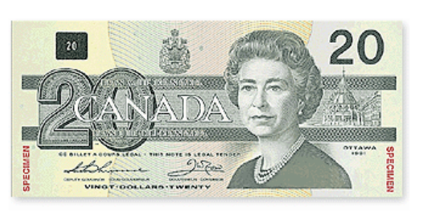
[A15] Add multiples of 10 to 50 with sums less than