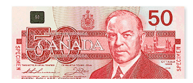
[A15] Add multiples of 10 to 50 with sums less than 100